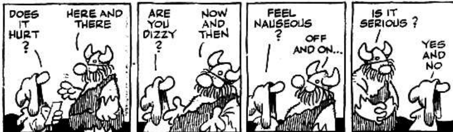
An INFP ordinary conversation!