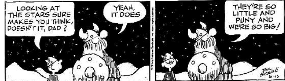
Hagar contemplates according to his inner thinking. Perhaps his extraverted intuition is a bit off-beat.