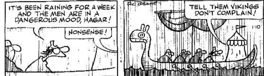
Hagar knows what's what and what is to be done. It's clear, therefore...