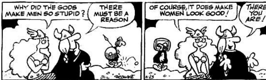
Both Honi and Helga are introverted intuitives, relishing the puzzle and delighted with their hunches. (Helga offers an INTJ version of the same joke later.)