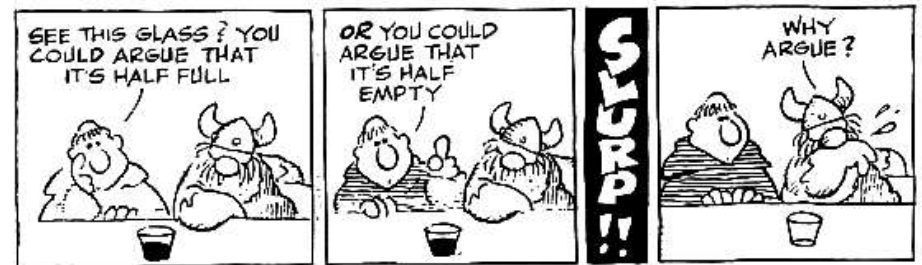
Hagar (J) responds (reacts) to the ENTP who enjoys discussing – for its own intuitive-thinking sake.