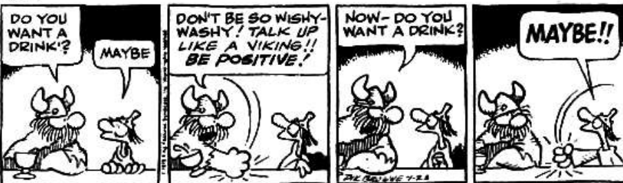
Sociable Lucky Eddie keeps his intuitive options open.