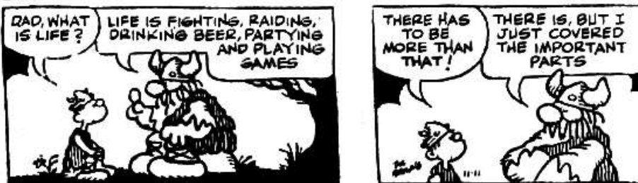
What feeling 'out there' (and what inner hunches!).